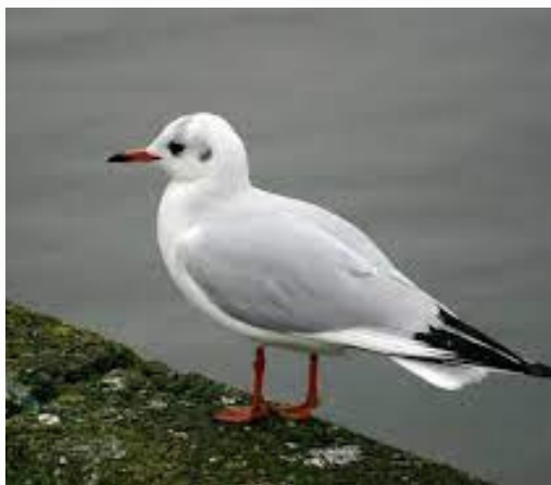
Black Headed Gull (in winter plumage)

There are several Gulls found in our area with the most numerous being Common Gulls ( Larus canus ) and Black-headed Gulls ( Chroicocephalus ridibundus )